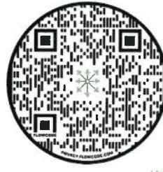
Scan for the Connection Card.