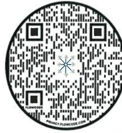
Scan for the Connection Card.

For weekly children's and youth formation and activities, there is a bi-weekly e-news that is sent to families with children and youth. To subscribe, visit our website or email.